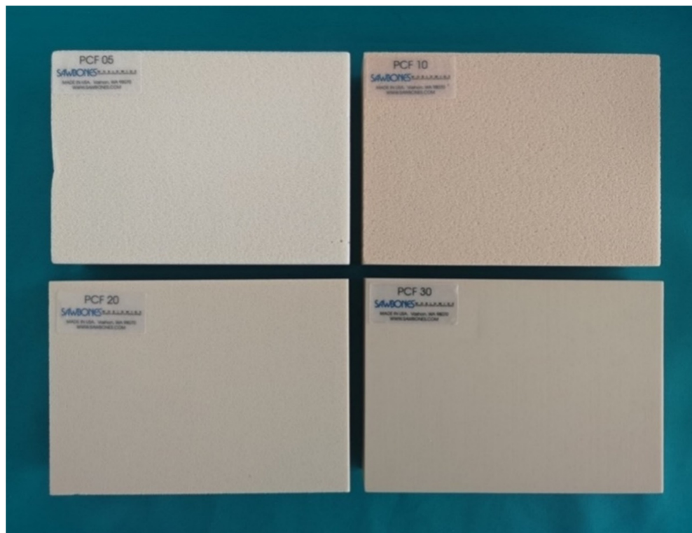
Figure 1. Artificial bone blocks of four different densities (D1–D4).

Experiments were conducted in a controlled room temperature between 20–25°C, under a consistent applied pressure of 2 kg. External irrigation was provided using saline at a steady flow rate of 50 mL/min, also at room temperature. The surgical contra-angle handpiece was secured to the drill stand to maintain the drill at a precise 90° angle to the bone blocks (Figure 2).