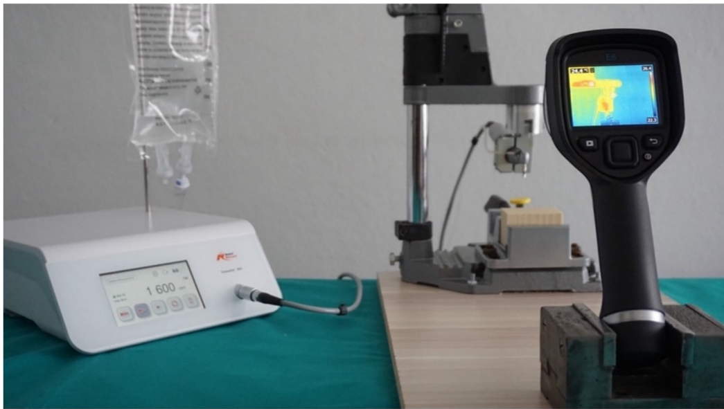
Figure 2. Experimental setup for measuring temperature changes during implant osteotomies.

The equipment setup included a physiodispenser (Nobel Biocare OsseoSet 300, W&H Dentalwerk, Austria) and a surgical contra-angle handpiece (WS-75L 20:1; W&H, Austria) connected to an implant motor (EM-19LC, W&H, USA). This arrangement was specifically chosen to ensure continuous drilling motion during the osteotomy procedures.