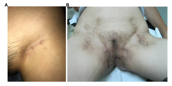
Figure 1. Appearance on the groin. (A) M-MTIT groin incision 8 months post-operative. (B) MTIT groin incision 12 months post-operative.

skin bridge from the fat pad of the lateral thigh. Finally, the groin node-bearing fatty pad was removed together with the complete radical vulvectomy specimen. In case of a large defect of the vulva, plastic surgery reconstruction involving skinflaps was performed immediately by experienced plastic surgeons [9]. The M-MTIT differed in three respects from the original MTIT. First, an inguinal incision of 3-5 cm that was parallel to the inguinal ligament was used in the M-MTIT (Figure 1A); while a midline vertical inguinal incision of 8-10 cm was employed in the MTIT (Figure 1B). Second, radical excision of the vulvar tumor was performed with at least 1 cm clinically clear surgical margins in the M-MTIT, while the minimal macroscopic resection margin was 2 cm in the MTIT. Third, all patients treated with the M-MTIT received negative pressure wound therapy on groin incisions, while patients undergoing the MTIT received standard-of-care dressing. The duration of negative pressure therapy was five to seven days.