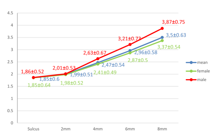
Figure 3. Mean thickness of the palatal mucosa at different heights of measurement and divided by gender.