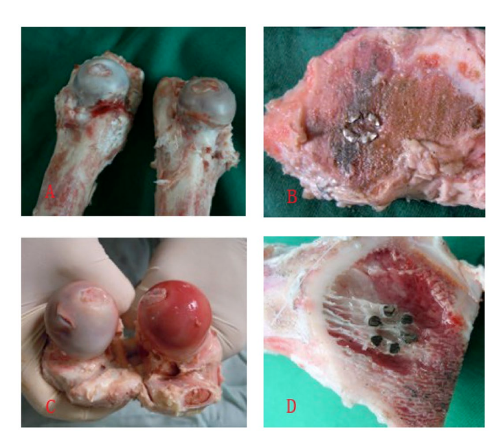
Figure 5. A showed the general specimens at week 8, kermesinus in Hb-DHS group(right), pale in DHS group(left); B showed transection of femoral neck and could see the flabellum-like-hole of Hb-DHS and plenty of trabecular bone formation at week 8; C showed the general specimens at week 16, pink in Hb-DHS group(right), kermesinus in DHS group(left); D showed transection of femoral neck and could see the flabellum-like-hole of Hb-DHS group(right), were sinus in DHS group(left); D showed transection of femoral neck and could see the flabellum-like-hole of Hb-DHS and a mass of trabecular bone formation at week 16.