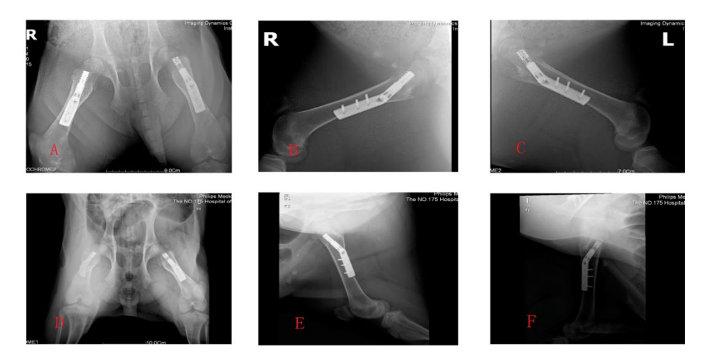
Figure 3. A,B,C showed the X-ray photographs at week 8 postoperatively; D,E,F showed the X-ray photographs at week 16 postoperatively.

Defined P<0.05 to be statistically significant difference; Vp demonstrated trabecular bone volume percentage; BMD demonstrated bone mineral density; M/S demonstrated Mean Rank/ Sum of Ranks; Z demonstrated Z test; P demonstrated exact.sig.