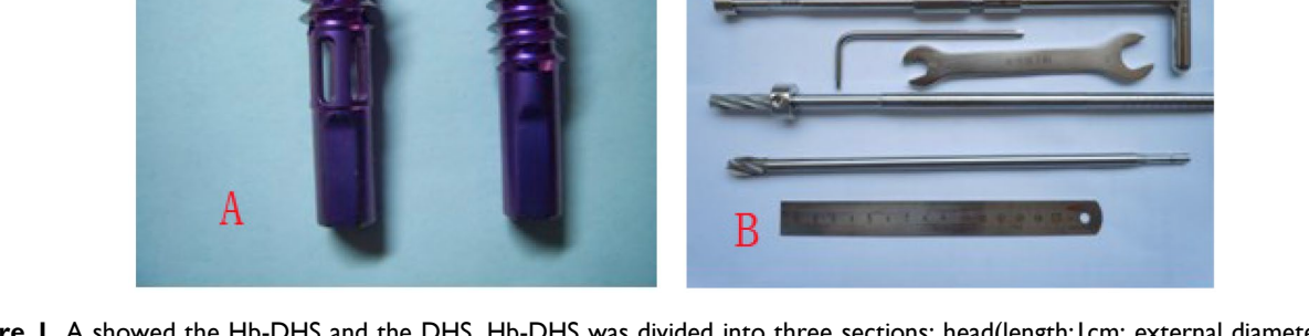
Figure 1. A showed the Hb-DHS and the DHS, Hb-DHS was divided into three sections: head(length:1cm; external diameter:0.8cm, inner diameter:0.4cm; 4 holes),end(length:1.5cm; external diameter:0.6cm, inner diameter:0.2cm); B showed the autogeneous-bone grafting instrument and DHS drills.

All experimental animal procedures were approved and in accordance with the guidelines of the Institutional Animal Care and Use Committee of the authors' institution. We selected eight 4-month-old pigs (either male and female, weighing 30–40 kg each) and maintained them in our experimental animal center for 1 week to acclimate to the diet, water, housing, and 12/12 hours light/dark cycle. We then performed three-dimensional CT scans on these animals and made hip models to assist the surgical procedure.