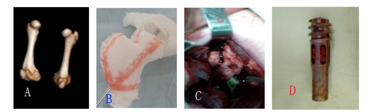
Figure 2. A showed three-dimensional CT scan of pigs' femurs; B showed femoral models of pigs; C showed fractured gap intraoperatively; D showed autogeneous bones were grafted into Hb-DHS.

Figure 1. A showed the Hb-DHS and the DHS, Hb-DHS was divided into three sections: head(length:1cm; external diameter:0.8cm, inner diameter:0.4cm; 4 holes),end(length:1.5cm; external diameter:0.6cm, inner diameter:0.2cm); B showed the autogeneous-bone grafting instrument and DHS drills.