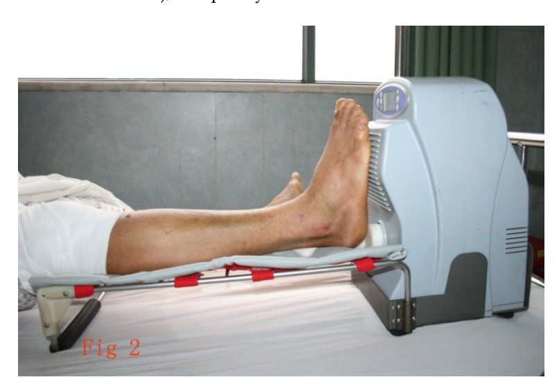
Fig 2 shows the RSSS instrument treating the right leg of a patient, male, 38 years old, closed fracture(fracture type Tscherne & Oestern<sup>[16]</sup> Type1) because of traffic accident, after intramedullary nail fixation the patient has given RSSS treatment.