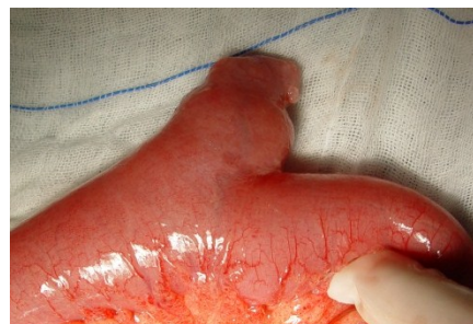
Fig. 2 perforated MD with broad-base ( \geq 2 cm)