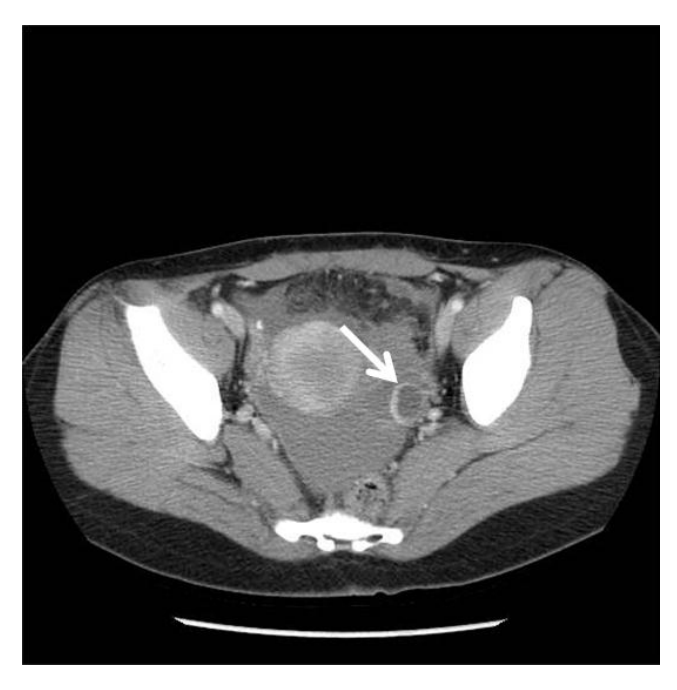
Fig.1 Fluid collection and left ovary cyst was noted on computed tomography. The size of ovary cyst was 2.0 \times 1.8 cm ( arrow ).

copy owing to incomplete bowel preparation. The bleeding was controlled by #3-0 Vycryl intracorporeal suture, and the invagination of the diverticulum was performed laparoscopically. The recovery was uneventful, and the patient was discharged on postoperative day 4.