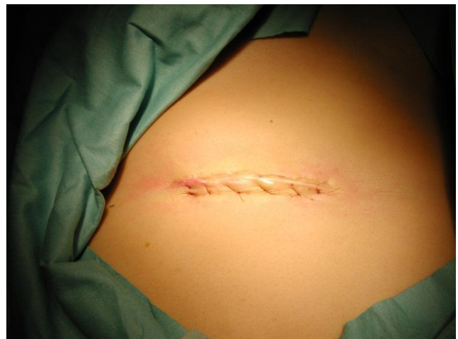
Fig.4: The final result