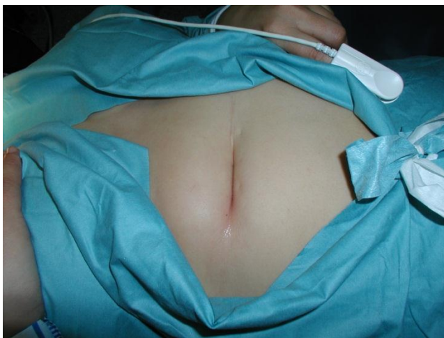
Fig.1: An example of a depressed scar of the abdomen.

At the end of this manoeuvre, in order to avoid the recreation of relapses, stitches formed in a U-shape are made in Nylon or Monocril 2-3/0 are made with a large needle and are placed close together so that a wide aversion is achieved at the margins of the scar and a deep wound closure is obtained by adhering to the undermined tissue (Fig.4). These stitches will then be removed about 2 weeks later. Afterwards, the patient should start to carry out massages on the entire treated area using moisturizing cream to aid the mobility of the recuperated tissue.