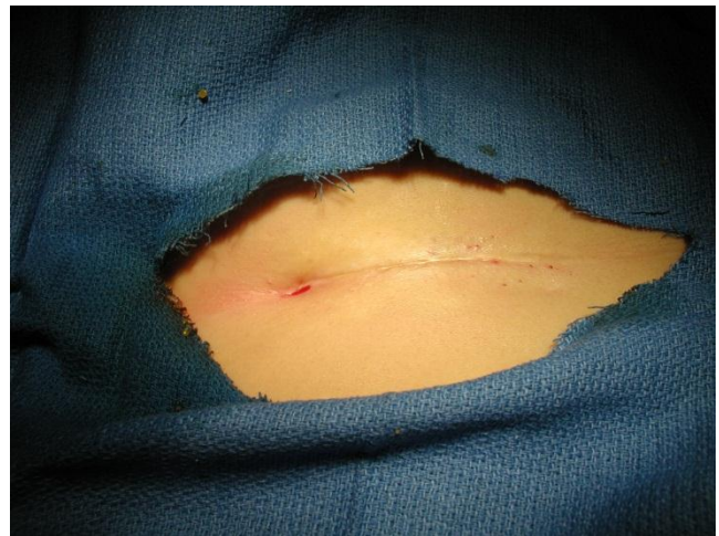
Fig.3: The scar is completely undermined