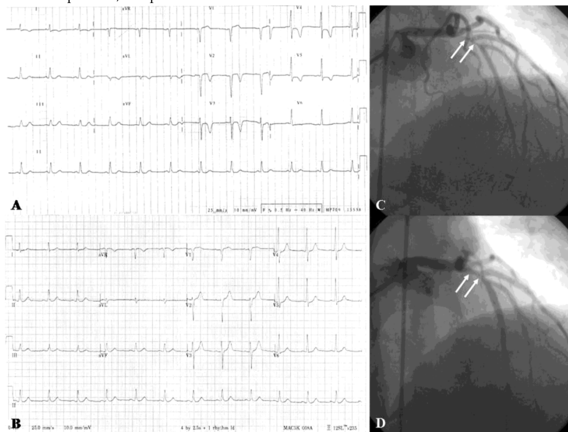
Figure 1. (A) Twelve-lead electrocardiogram in a 50-year-old male showing T-wave inversion in leads I, aVL, V 2-6 . (B) Normal electrocardiogram after 6-month treatment with diltiazem. (C) More than 90% spontaneous vasospasm in the proximal left anterior descending artery (arrows). (D) The vasospasm was relieved after intracoronary administration of 100-µg nitroglycerin (arrows). (Reproduced from Hung MY, Hsu KH, Hung MJ, Cheng CW, Kuo LT, Cheng WJ. Interaction between cigarette smoking and high-sensitivity C-reactive protein in the development of coronary vasospasm in patients without hemodynamically significant coronary artery disease. Am J Med Sci. 2009; 338(6): 440-446, with permission of the publisher. Copyright © Wolters Kluwer Health, 2009.)

While VF can often be terminated by cardioversion [15], VF rarely terminates spontaneously [39] as CAS-related spontaneous reversion of VF has been reported to do [40]. Spontaneous termination of VF has been documented in a 62-year-old woman following an acute postero-lateral myocardial infarction [41], a 67-year-old woman with a syncopal episode after awakening from sleep [42], and a 21-year-old woman during exertion at night [43], although CAS was not documented in those reports. In a study of VF episodes in patients with implantable cardioverter defibrillators [44], 43% were asymptomatic and 40% were nonsustained episodes. If VF is <10 seconds in duration then the incidence of syncope or pre-syncope is 25%, compared with 62% if the arrhythmia is \geq 10 seconds. Therefore, CAS should be considered in the differential diagnosis of syncope.