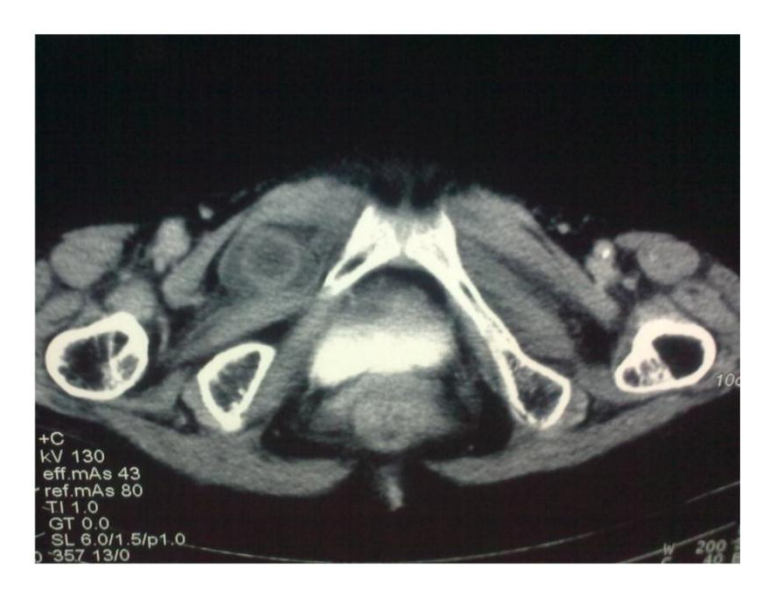
Figure 1. Computed tomography demonstrated a fluid-filled mass located between obturator externus muscles and ipsolateral pectineus.

perforated lesion was noted. Intestinal segmentectomy and simple suture closure of obturator foramen were performed. The patient was recovered uneventfully and discharged one week after operation. No recurrence was noted within one and a half years of follow-up.