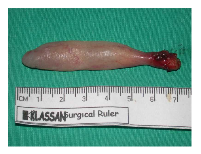
Figure 3. Hypopharengeal mass (Intraoperative view).