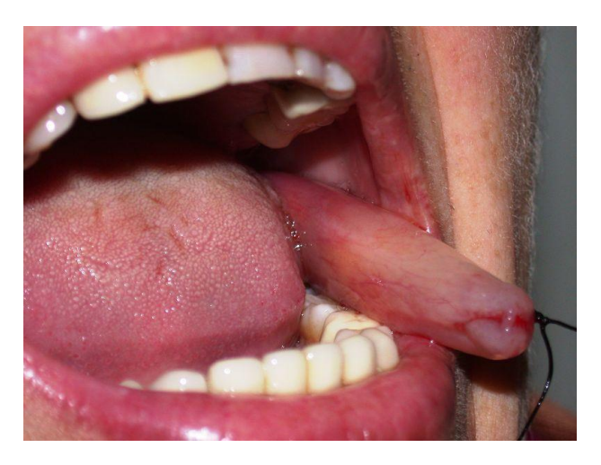
Figure 1. Preoperative view.