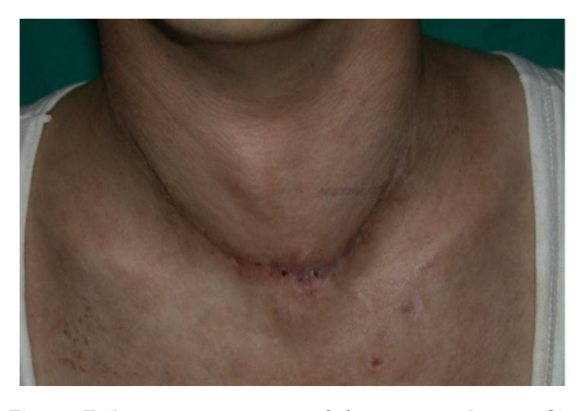
Figure 7: Postoperative view of the patient (Patient 2).