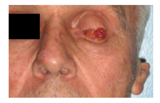
Figure 2 : A 71-year old male with a slowly growing mass on his left eye. The biopsy revealed poorly-differentiated squamous cell carcinoma (Patient 1, preoperative frontal view).

A 71-year old male with a history of penetrating trauma, admitted to Ophthalmology clinic for slowly growing mass on his left eye (Figure 2 and 3). Two years after the surgical removal of the mass, he developed another mass originated from the conjunctiva. He was referred to our clinic after the incisional biopsy revealed poorly-differentiated squamous cell carcinoma. The tumoral mass as well as orbital contents were surgically removed and the orbit was reconstructed with a left TPFF and split-thickness skin graft (Figure 4). No complication was seen. In a two-year follow-up, he had no sign of recurrence.